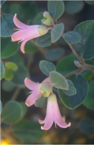
Correa alba Coastal Pink™ 'COR10' (b)

Coastal Pink is a hardy variety for landscaping that tolerates coastal conditions. In Autumn, light pink flared bell flowers appears. H 2m x 2m