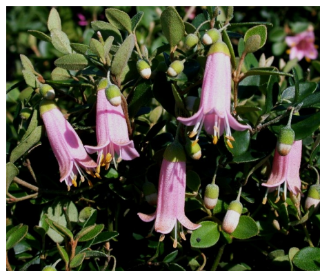
Correa Bicheno Bell

Correa Bicheno Bell is a rounded native with mid green foliage and produces a vibrant display of bright pink, bell shaped flowers from Autumn through Winter.