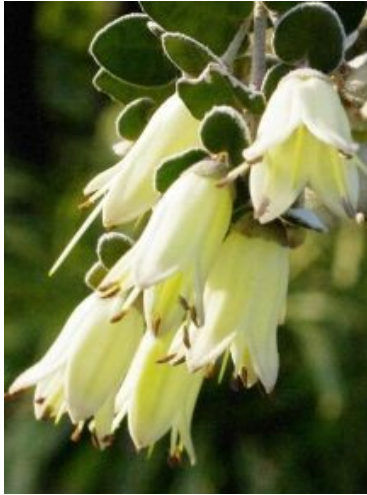
Correa Lemon Twist

Coastal Pink is a hardy variety for landscaping that tolerates coastal conditions. In Autumn, light pink flared bell flowers appears. H 2m x 2m