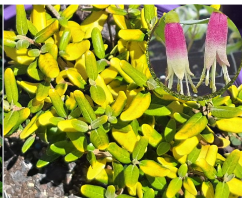
Correa Barossa Gold

Barossa Gold has a rounded habit with a wonderful display of dusky red, bell shaped flowers through winter to spring. The soft golden foliage provides an interesting contrast.