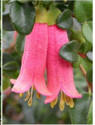
Correa Little Cate

Dense low mounding ground-cover, with dainty bell shaped flowers between Autumn to late Winter. Lime buds open then fade to ivory as they age. H 20-35cm x 50cm