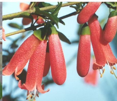
Correa Annie's Delight

Annie's Delight is a medium shrub with small dark green leaves and that has bright red tubular flowers from early May to mid August.