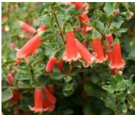
Correa Amber Chimes (D)

A tidy small shrub to 50cm with dainty orange flowers in autumn to late Winter. It has dense, green foliage. Frost tolerant.