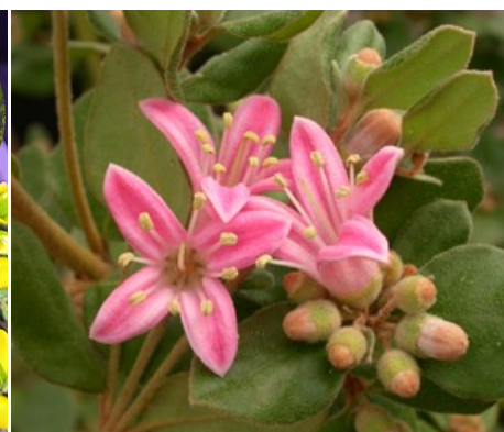
Correa Catie Bec (D)

A small spreading correa with small rounded foliage. Clusters of pink/star shaped flowers can be seen through most of the year. A great option for containers, cottage and coastal gardens.