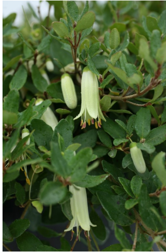
Correa Lime Chimes (b)

Is a lovely display of lemon bell shaped flowers against green shiny foliage. Irresistible to birds, Lemon Twist will flower in both sun and part shade. H 20cm x 1.2m