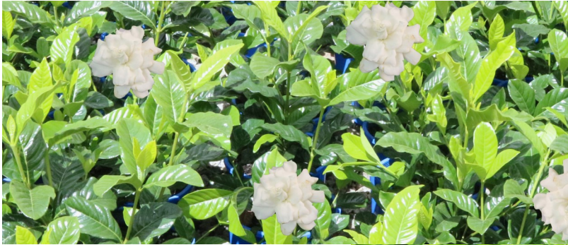
Gardenia 'Aimee Yoshiba'

Dark green, glossy leaves on a medium growing shrub to 2.5m. Double white fragrant blooms that flower prolifically from spring in to the warmer months. Prune to maintain shape but not too heavily. H 1.5m x 1.2m