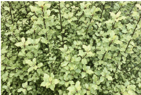
PITTOSPORUM SCREEN BETWEEN (D) Screen Between is a naturally branching, dense plant to 3m requiring little pruning compared with other hedging plants. It has silver-grey rounded foliage that contrasts beautifully against darker stems.