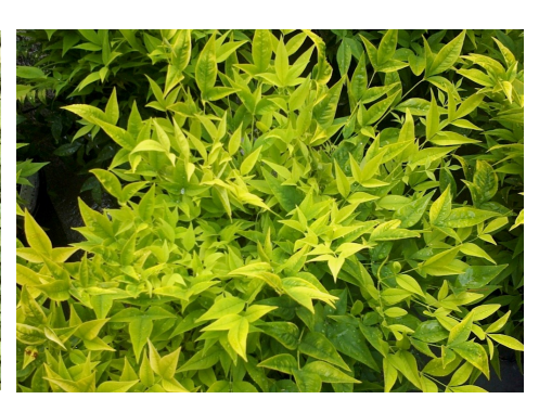
NANDINA LEMON LIME (D) Year round coloured foliage with bright lemon coloured foliage aging to lime green. A compact grower with a neat natural shape requiring no pruning. Frost hardy. Plant in full sun to part shade in moist well drained soil. Moderate water requirements. H 70-90cm W 70-90cm