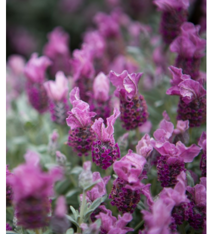
FROSTBERRY RUFFLES (b) New variety of Lavender with silver green foliage and deep pink ribbons from flower heads.

The ruffles range of lavender are bred for their distinctive ruffled coloured bracts that appear from late Winter into Spring.