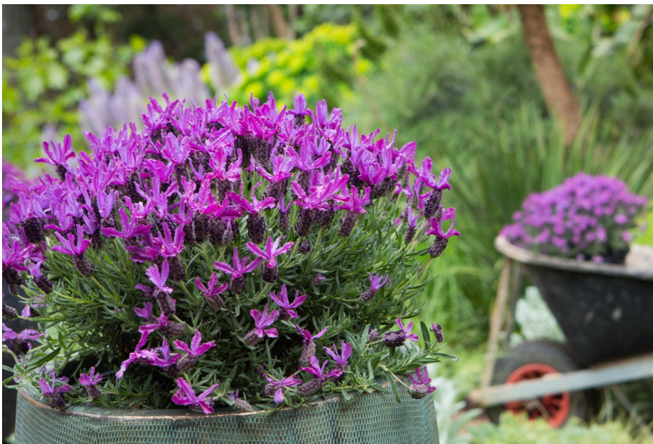
ROSEBERRY RUFFLES (b) A long flowering variety with aromatic foliage and plum flowers with large, ruffled wings. Great for containers, small spaces and informal low hedges.