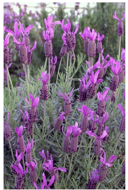
Lavender Avonview Bright purple flowers with grey-green foliage.