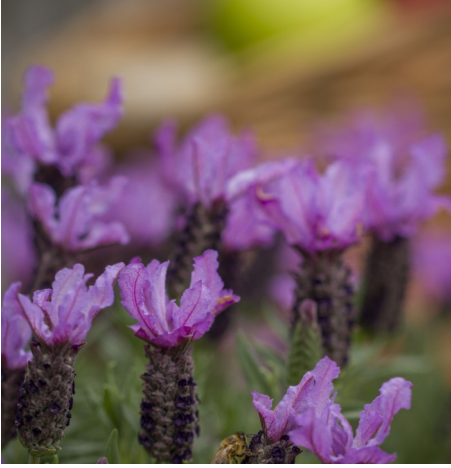
BLUEBERRY RUFFLES (b) Deep mauve/purple flowers on soft gre-green foliage.