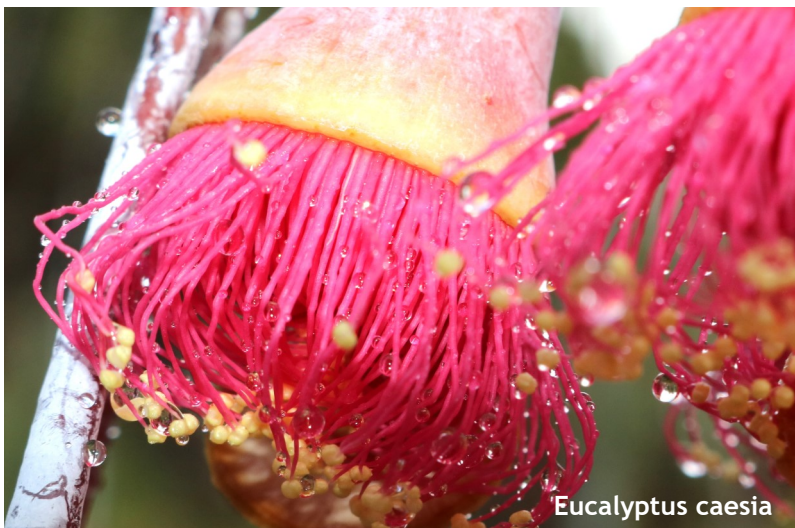
Eucalyptus caesia 'Silver Princess'

Fraxinus griffithii Hymenosporum flavum Schinus molle Talipariti (Hibiscus) tiliaceum 'Rubrum' Tipuana tipu Virgilia capensis