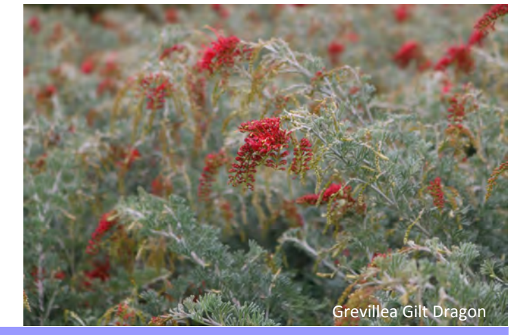
Grevillea thelemanniana Gilt Dragon is a weeping, rounded shrub with a prolific display of lantern orange-red flowers in Winter. It is ideal for small gardens and makes an attractive informal hedge. Full sun to part shade H 1m W 1m 140mm & 175mm Pots

Cistus Silver Pink are a gorgeous small plant to 1.2m. Crept paper like soft pink flowers attract small pollinating insects throughout Spring. Full sun to light shade H 1.2m W 1.2 m 140mm Pots