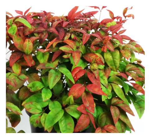
NANDINA BLUSH<sup>TM</sup> (D Compact shrub with bubbly red blushing leaves for nine months of the year with main flush in Winter. Plant in full sun to part shade. Will tolerate heavier soils with reasonable drainage. Low water requirements. Water during extended dry periods. H 60-70cm W 60m