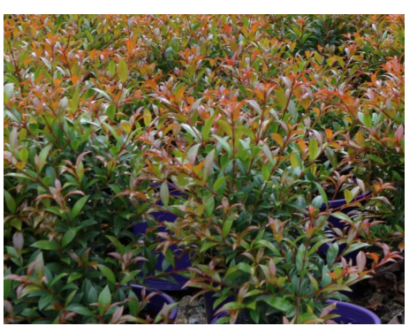
BUSH CHRISTMAS (D Bushy shrub with a compact habit that can be trimmed into a dense hedge or topiary. Bronze new growth in Winter. Has edible pink berries.