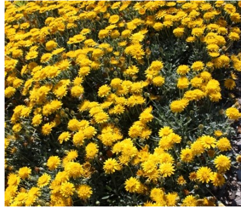
GAZANIA DOUBLE GOLD<sup>TM</sup> (1) Hardy spreading groundcover with sterile blooms that flower prolifically from Sept to April. rockeries, Great for low maintenance gardens, coastal plantings or sand dune stabiliser. Position in full sun in free draining soil. Low water requirements once established. H 20cm W 60cm