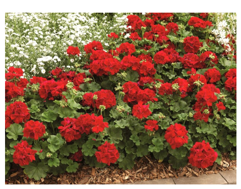
GERANIUM BIG RED

This cultivar is a dwarf clumping form and has denser foliage. Yellow round flower heads appear in Spring. Great for rockeries, borders, low maintenance gardens or coastal plantings. Position in full sun in free draining soil. Low water reguirements once established. H 20cm W 40cm