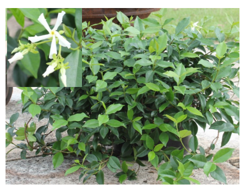
FLAT MAT<sup>TM</sup> (D A lower growing flatter type of Japanese Star Jasmine. Clusters of small white star flowers appear during Summer. Can also be used as a climber. Plant in full sun or part shade. Moderate watering required. H 30-40cm W 3-4m

H 2-3m W 1.5m Can be pruned much smaller