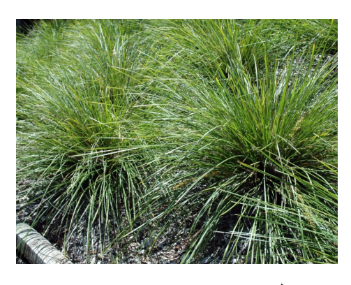
LOMANDRA VERDAY (D Hardy native grass that is drought and frost tolerant. It has arching, semi-pendulous foliage that add movement to the landscape. Tolerates coastal sites and a wide range of soil types from sandy to clay. Low water requirements once established. H 60cm W to 1m