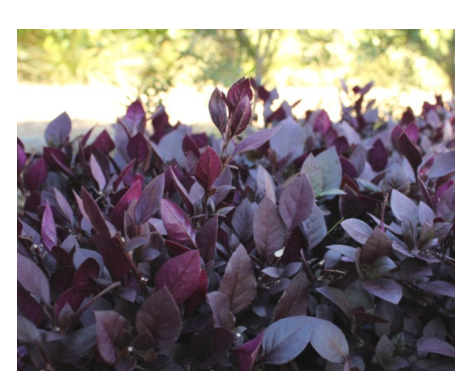
ALTERNANTHERA LITTLE RUBY<sup>TM</sup> (b)

Gazania Double Gold Hibbertia scandens Lomandra Lime Tuff Nandina Obsession Scaevola Purple Fanfare Trachelospermum jasminoides Tulbaghia Silver Lace