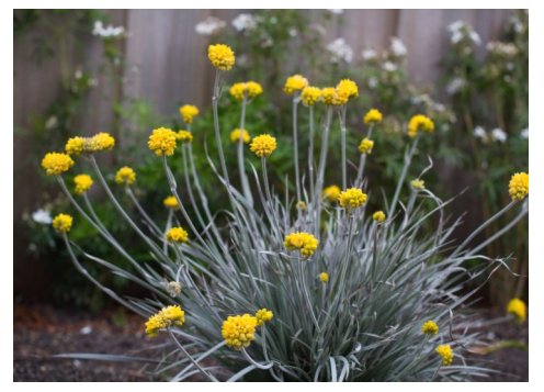
CONOSTYLIS SILVER SUNRISE ()

Great contrast plant with it's stunning burgundy foliage. Great for borders and planting en masse in garden beds. Plant in full sun to part shade in well drained soil. Frost sensitive. Moderate watering requirements. H 30-40cm W 60-90cm