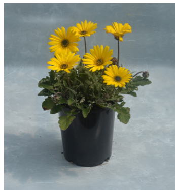
Safari Sun PBR NEW