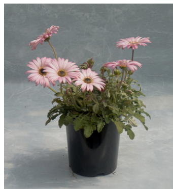
Safari Mist PBR