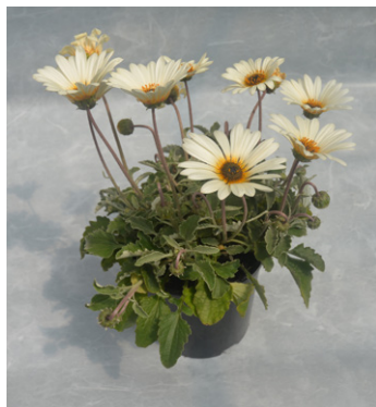
Safari Moon PBR NEW