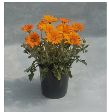
Safari Dust NEW