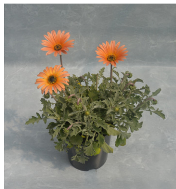
Safari Haze NEW