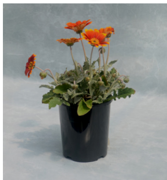
Safari Wild NEW